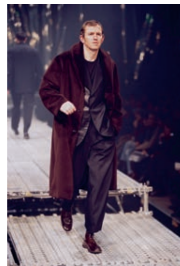
Me as a catwalk model for Yohji Yamamoto. Paris 1996 Not a professional model, obviously. I was slightly reluctant but also proud to be asked.