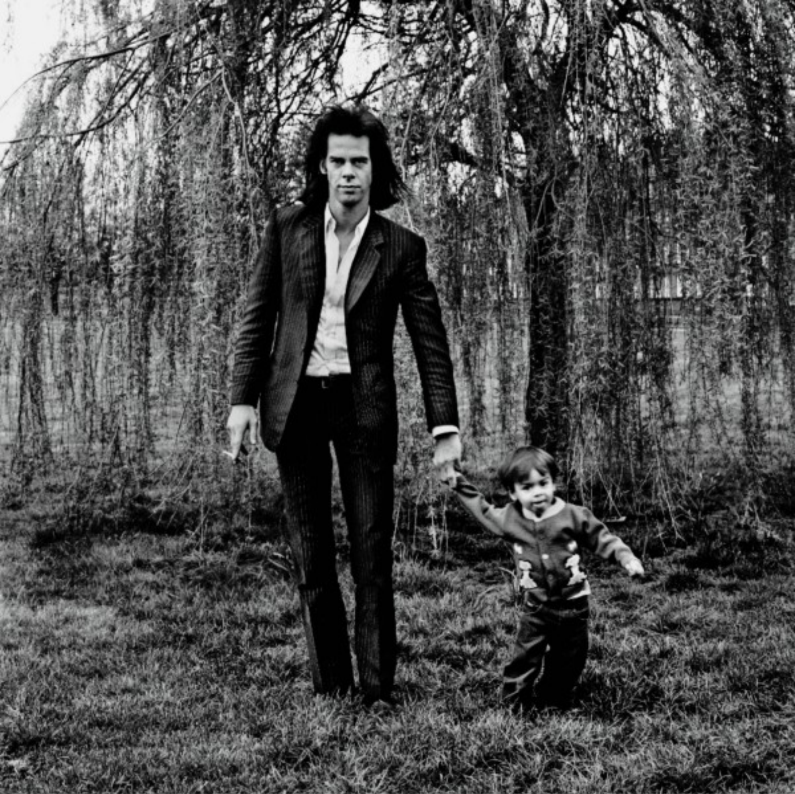
NICK CAVE & SON london 1993