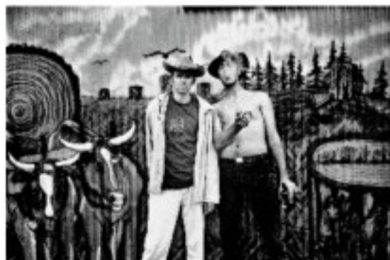
ANTON & KIRST NOVOSELEC (NIRVANA) Seattle, 1993

When I reached the stage I took some snapshots with the black-and-white film in the camera. I pressed the button no less than nine times! Later I sent five shots to a national music magazine that, sure enough, published three of them, under the guise of "submitted by a reader." Without payment, of course, but for me this was a Eureka moment. Suddenly I had a purpose in life, and what a purpose: to be a photographer at concerts was the best way to be part of this exciting world.