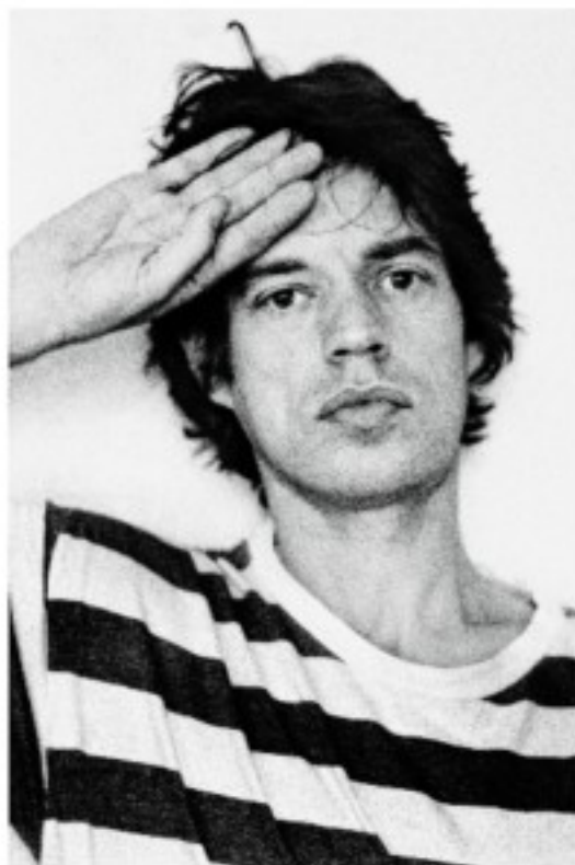
MICK JAGGER london 1960