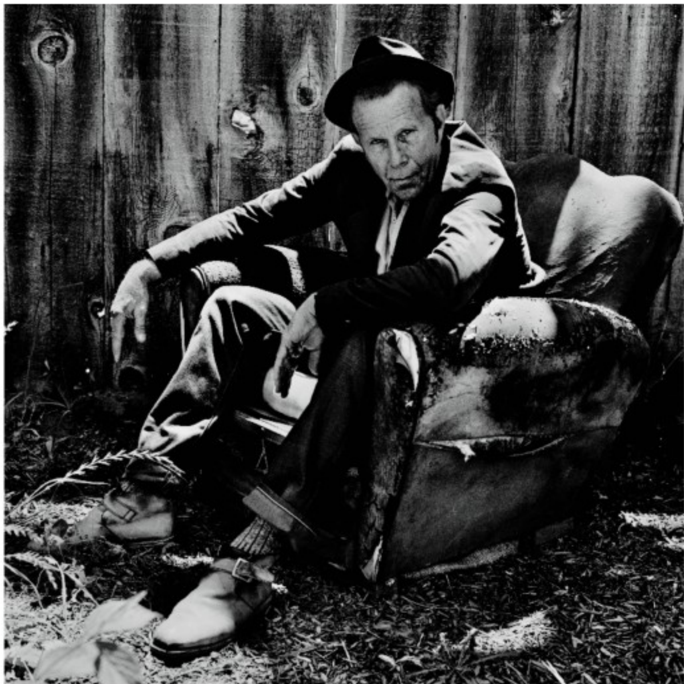
TOM WAITS sebastopol 2011