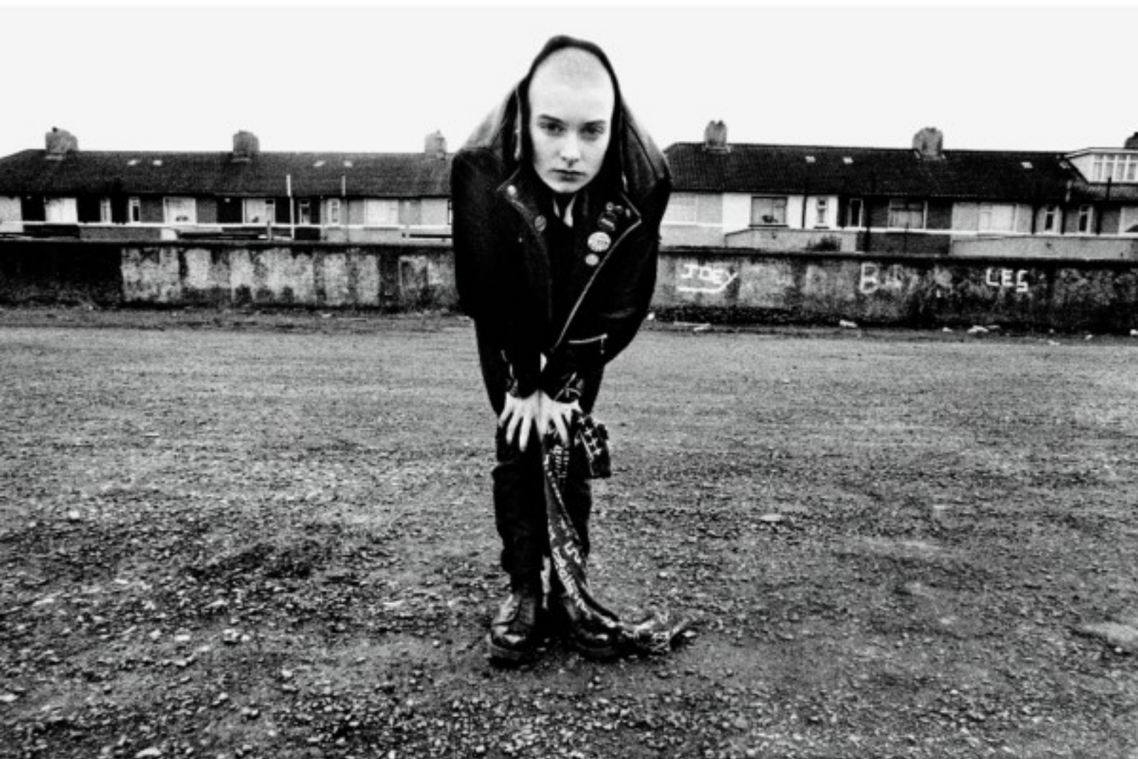
SINÉAD O'CONNOR dublin 1968