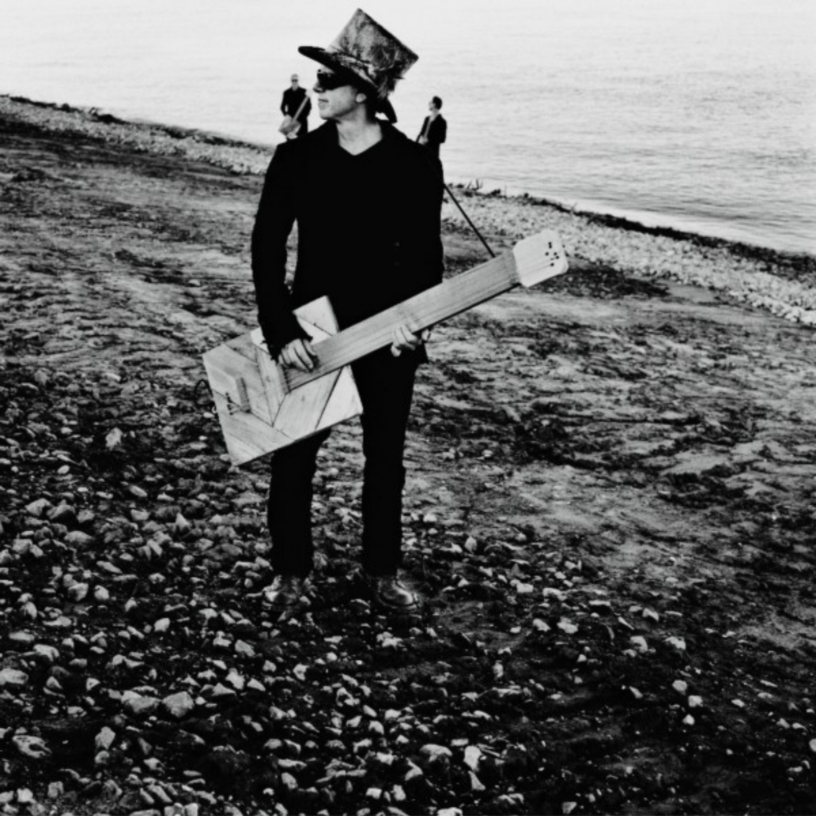
DEPECHE MODE new orleans 2018