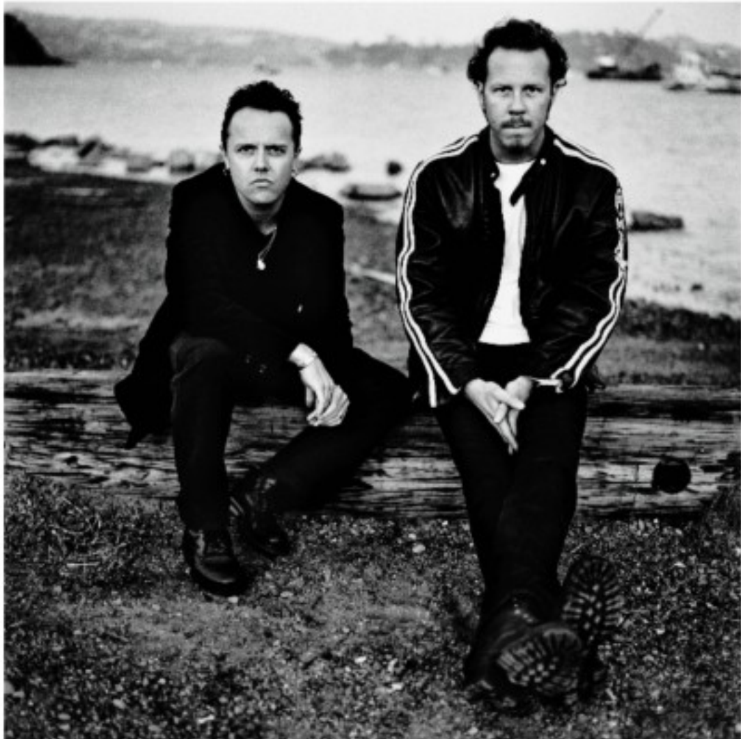
LARS ULRICH & JAMES HETFIELD san francisco 1997