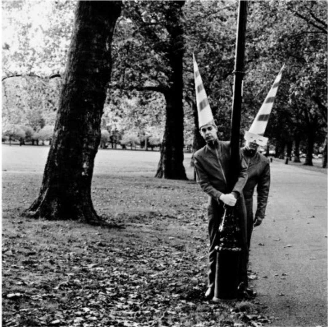
PET SHOP BOYS london 1993