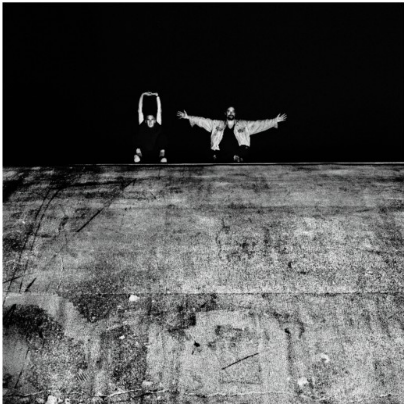
R.E.M. los angeles 1992