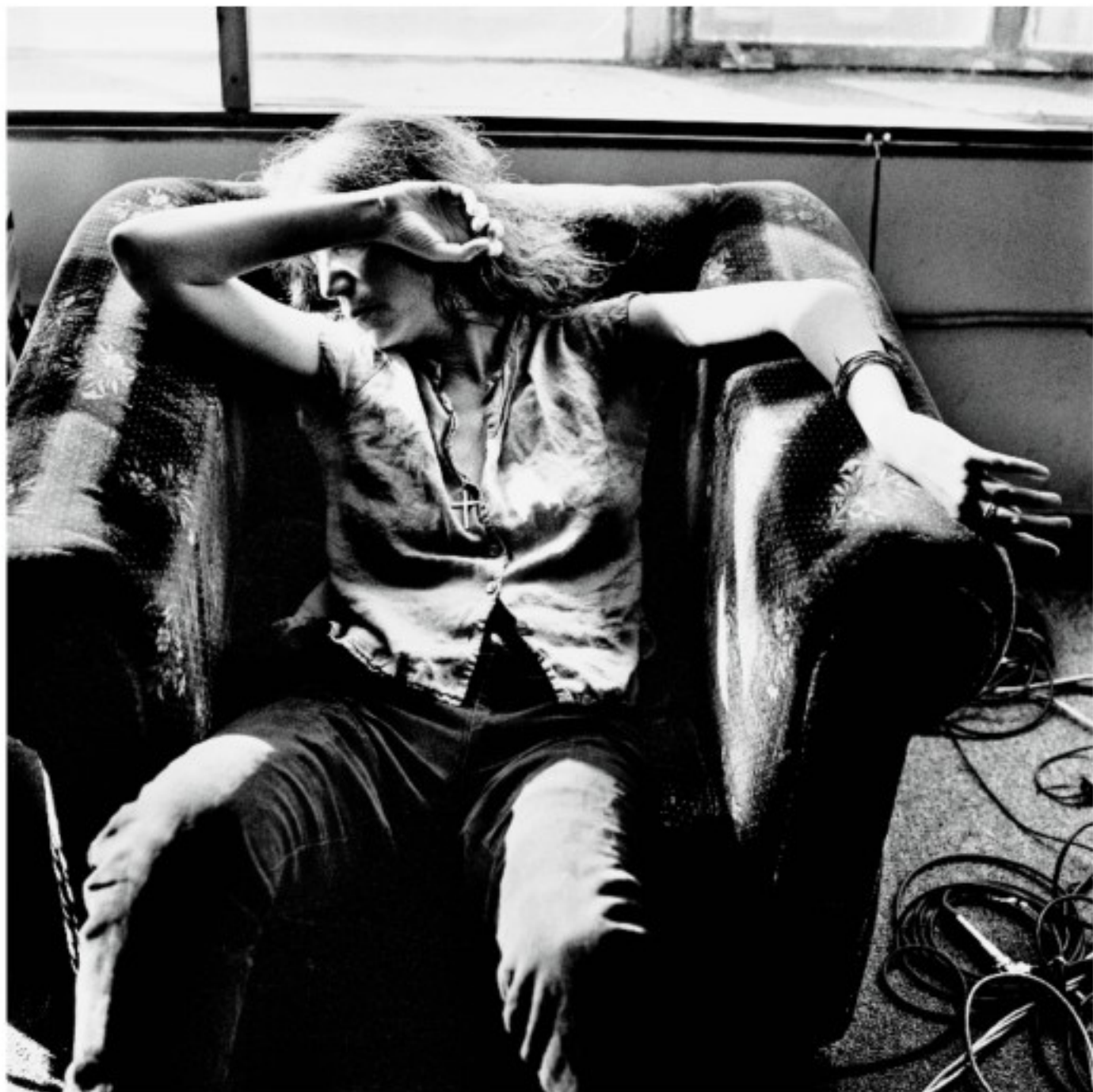
PATTI SMITH new york 1999