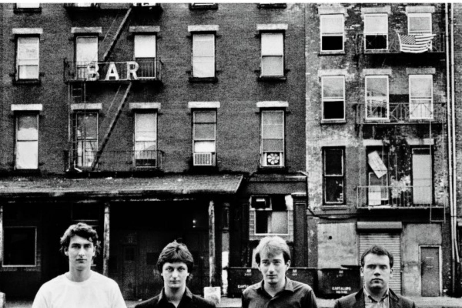
GANG OF FOUR new york 1980