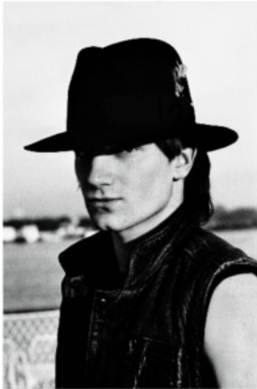
BONO new orleans 1982