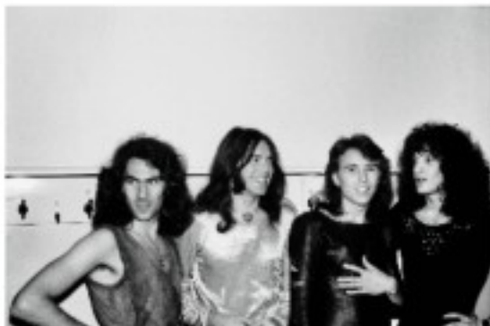
GOLDEN EARRING Groningen, 1972

The performance began at about two in the afternoon, on the city's main square, the Grote Markt. But how could I overcome my shyness, when I would be visible to everyone? I had no idea how to move around in this unfamiliar city. A shy boy's dilemma. Inventive as I was, I asked to borrow my father's camera. With this in my hands I would have, or so I reasoned, a perfect excuse to walk right up to the stage. It was a strange and somewhat contradictory reasoning, but for me it worked.