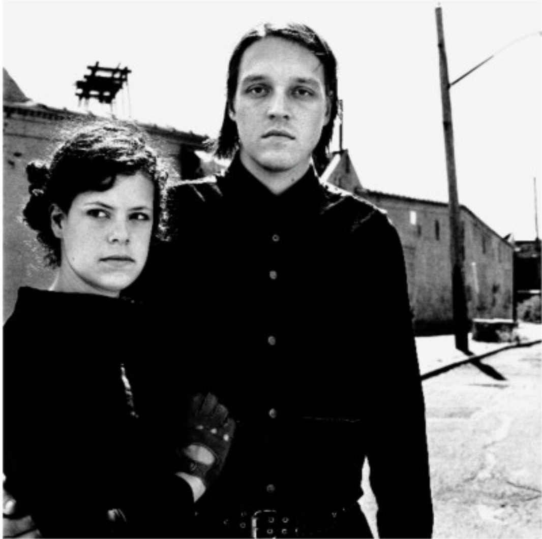
REGINE CHASSAGNE & WIN BUTLER new york 2005