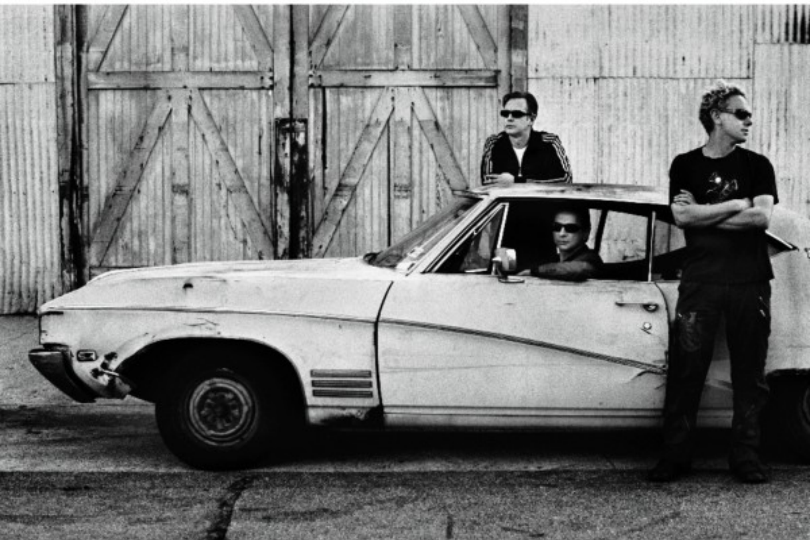
DEPECHE MODE santa barbara 8005