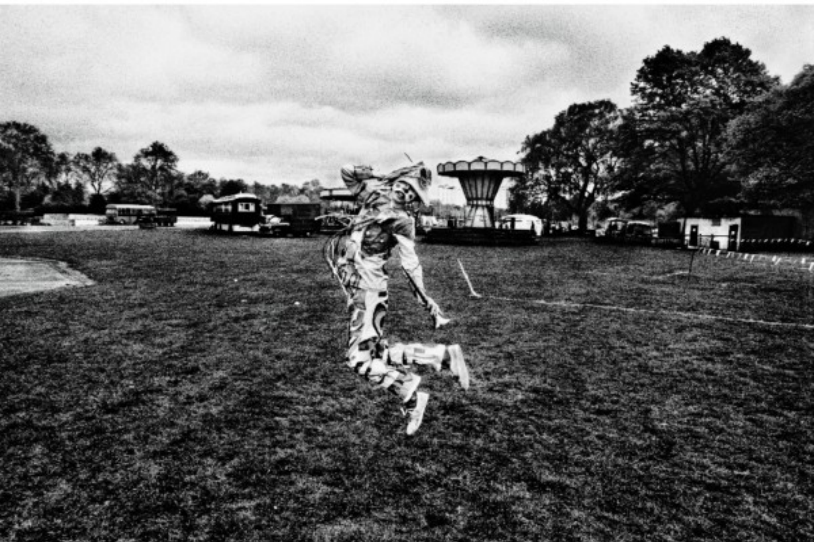
FAD GADGET London 1981